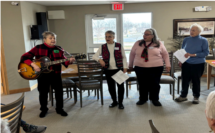
The Belles in full song