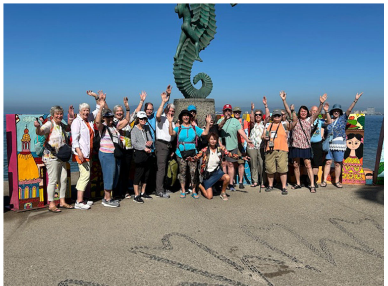
Whole group on the beach