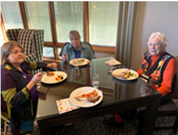
11:45. Pizza Party followed