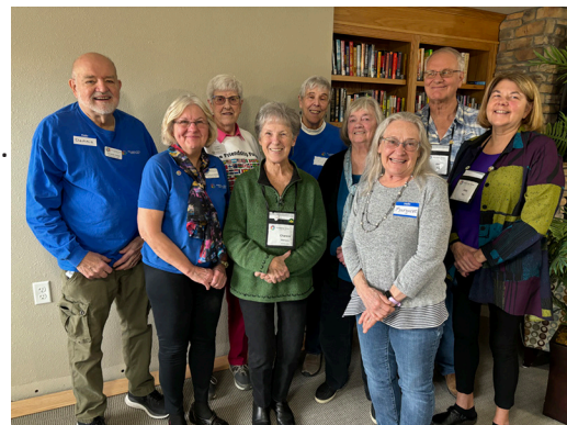
2024 Officers in January