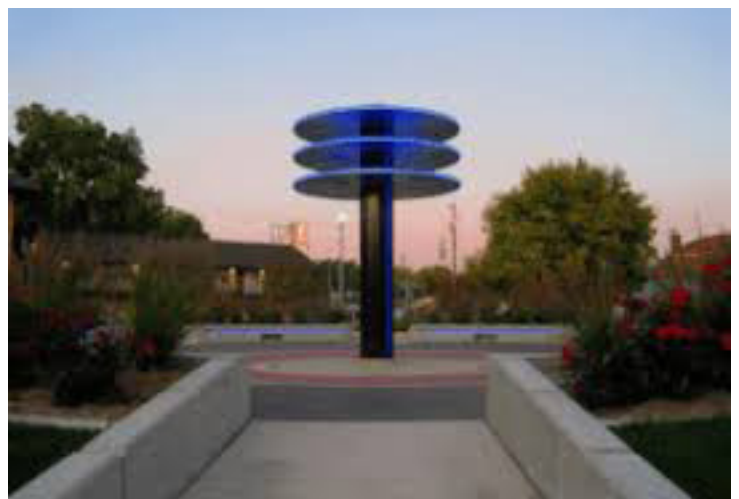
Three Star Plaza tribute to 3 rock and roll icons.