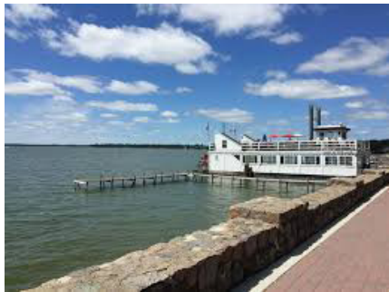
Clear Lake Sea Wall - on Register of Historic places.

At 2:00 the nine explorers took off from the City Park for a 14-mile tour around the lake. They parked by the Sea Wall, which was built by the WPA in 1936 and is on the Register of Historical Places. One person in each car read from a script describing what we were seeing. The City Dock and the Clear Lake Yacht Club came next. They headed on South Shore Drive to see cute rental cottages by the City Beach and the Outing Club built by businessmen from Mason City in 1895. Their concept turned out to be the first condominium built in the U.S. They passed the only hotel on the water, the Lakeside Inn, and drove through the popular campground at Clear Lake State Park, then pulled into the parking lot of P.M. Park which was built in 1914 by the Oddfellows, a secret society. It is now a restaurant, hotel, and outdoor bar. They drove through the former Methodist camp where all of the cabins were once owned by churches. They drove past the Girl Scout Camp to the town of Ventura (also located on the lake) where we saw an art deco gymnasium and auditorium where basketball player Lynne