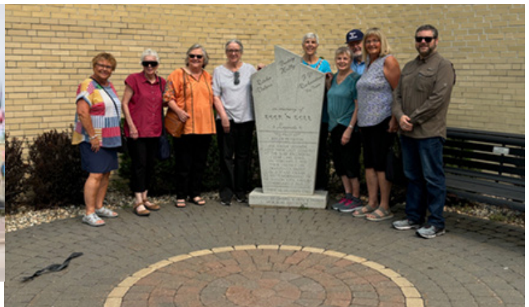
7 FFCI members plus guests pose with memorial to 3 rock stars who died in plane crash in 1959.