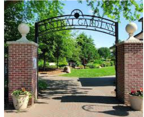
Gate to Central Gardens of North Iowa.

just a few blocks from downtown. It is three acres of themed flower beds, ponds, a stream bed, and art. They sat and talked in the shade before heading to the Half Moon restaurant at 5:30. The place filled up with people who came in later and were getting served before our group. (That often happens when you're in a large group.) But the FFCI group had lively conversations, so they relaxed and ate bread before the delicious meals arrived. Everyone was were back in Ames by 9:00.