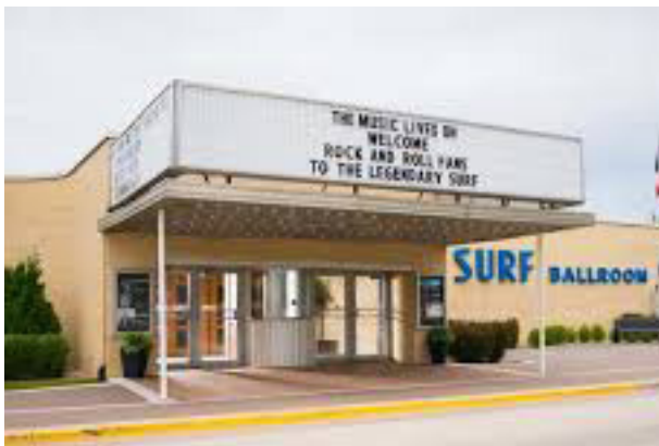
Surf Ballroom Clear Lake, IA