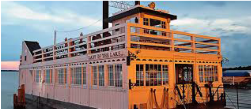
Lady of the Lake (a no show for engine repairs)

The group met up again at the Lady of the Lake paddlewheel boat by 3:45. It was supposed to take off at 4:00, providing there were enough people to take it out (which is 15). Good news! There were at least thirty-five people waiting to get on. Bad news! At 4:00 the boat owner showed up with a rubber hose in his hands which he said was an essential part of the boat which needed to be installed now so that the boat could go out at 7 P.M. They decided to go with plan B, which was to walk around the Central Gardens of North Iowa, which is