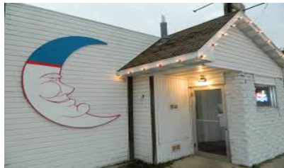
Half Moon Restaurant and Supper Club