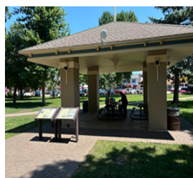
City park pavilion for lunch