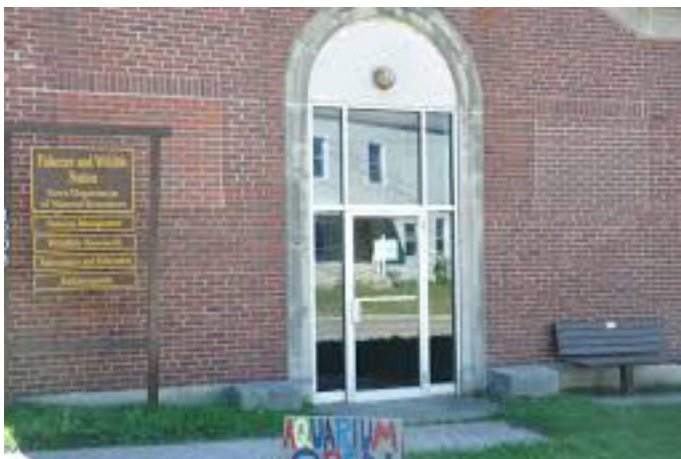
DNR Fish Hatchery and Wildlife Exhibit

Back in the city limits of Clear Lake, the group stopped at the State Fish Hatchery to see tanks of typical fish found in the lake, such as walleye, perch, and muskie. Close to the Surf Ballroom they saw Three Star Plaza, a small city park that is a tribute to rock 'n roll icons Buddy Holly, Richie Valens, and JP "The Big Bopper" Richardson. A spindle sits in the center of the plaza, with three stacked records on top. With the push of a button, you can hear their stories and snippets of their songs.