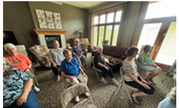
Right some of FFCI members participating.