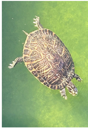
Kemp Ridley Turtles