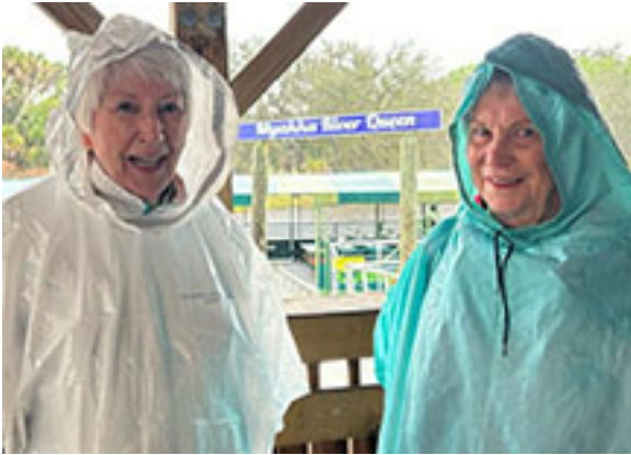
Rainy day boat ride.

Day 5 was still rainy but we were able to take the boat tour at Myakka River State Park and search for alligators, who were not out sunning themselves on the banks (no sun). On the way