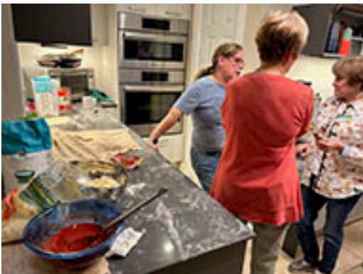
Preparing pizzas for baking.