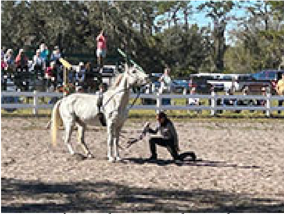
Hermann's Royal Lipizzans horse show.