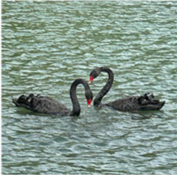
Black swans on Glenorchy Lake