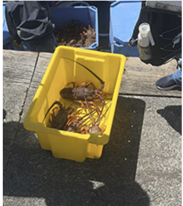
Mud Bugs at Akaroa