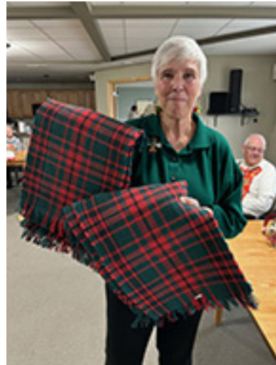
Smiles - Everywhere.A