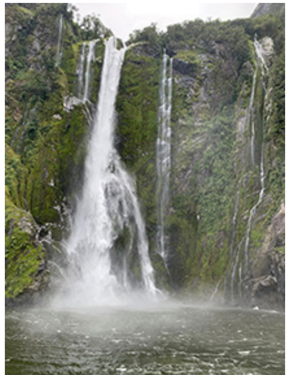
Waterfall at Milford Sound