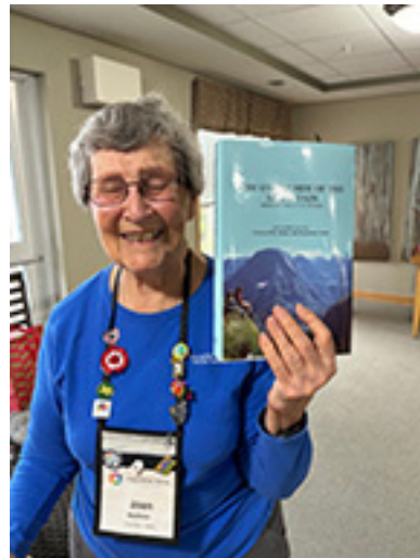
A fun way to start each year's FFCI Holiday Season.