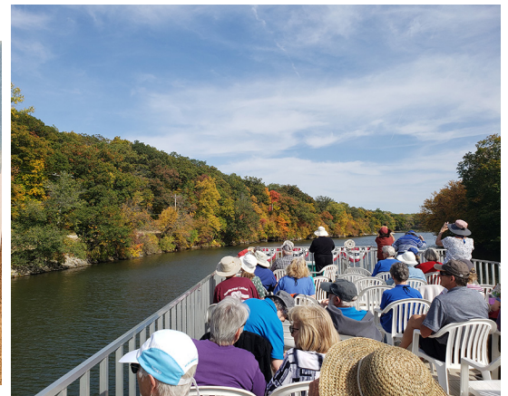
Cruising down the Iowa River.