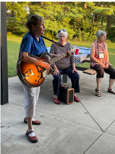
The Belles lead the sing-a-long.