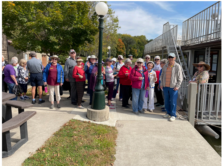
All aboard: 30 FFCI members and 6 FFGDM club visitors. Off on a beautiful fall cruise.

This was our first post pandemic outbound domestic journey from Ames. I am sure this inspired all of us to contemplate future longer Friendship Force journeys to farther destinations throughout the US and even the world in the years to come.