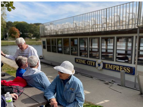
Boat arrives for tour.