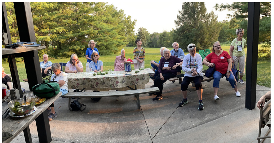
Some of the crowd of 30 members.