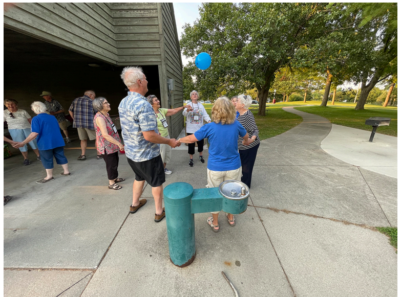
Balloon games after great potluck food.