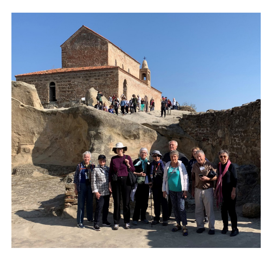
Join us for a presentation about